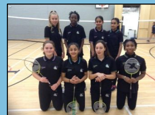
Badminton District Pairs Winners and Team Runners up!