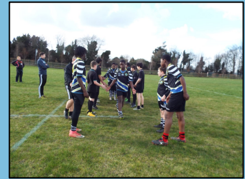
Image shows the 'tunnel' after the St John's/St Columba's match with the St John's players clapping their counterparts from St Columba's through the 'tunnel' of players.